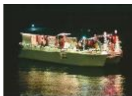
Emerald Grande Shuttle

Captained by Cindy & Crew Tour Boat/Motorized